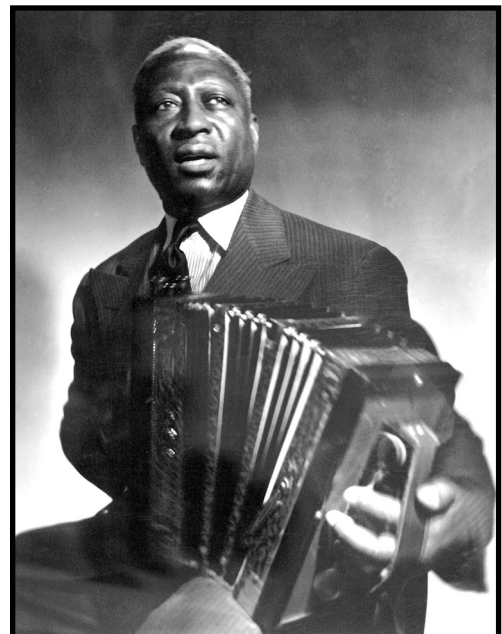
Below, Leadbelly on accordion.