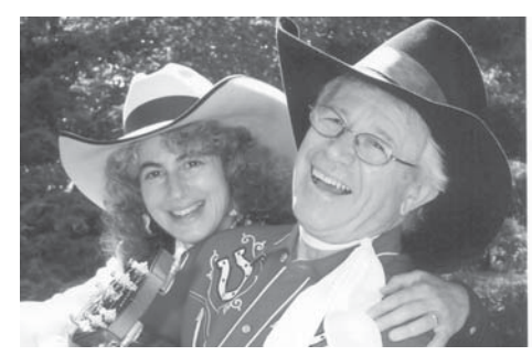
KG & The Ranger